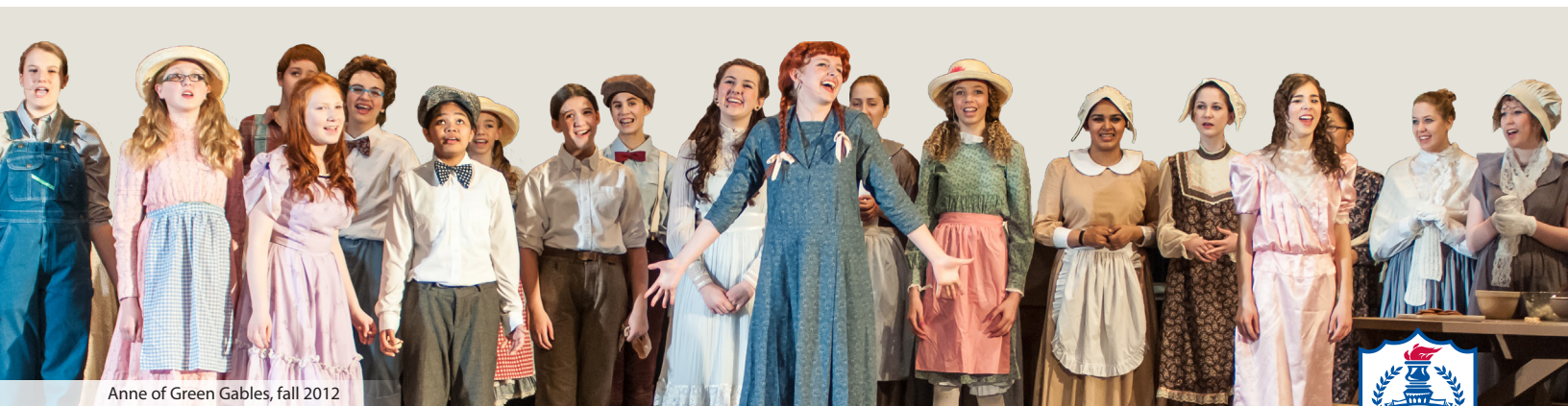
Anne of Green Gables , fall 2012