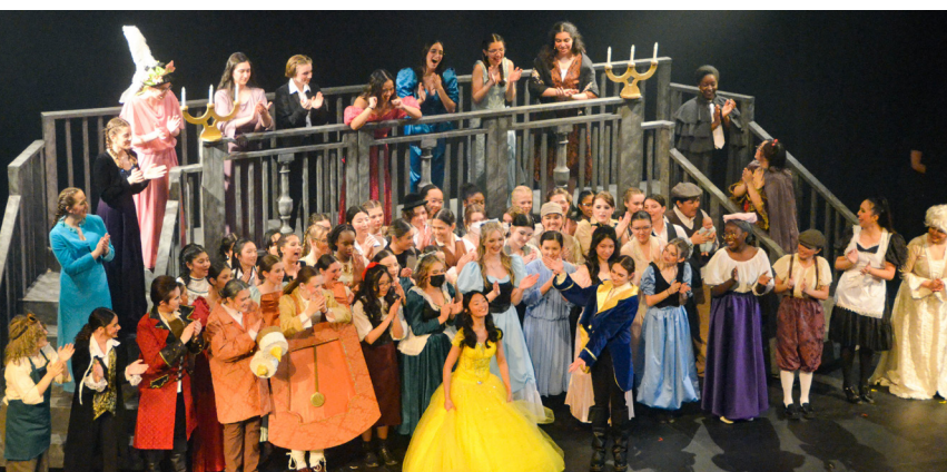
Disney's Beauty and the Beast , spring 2023