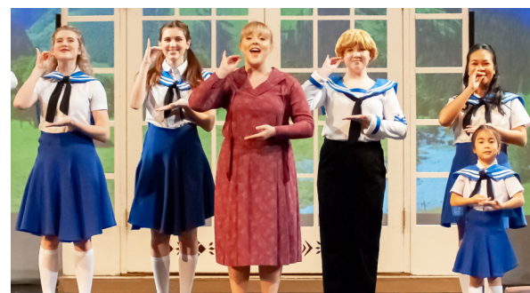
The Sound of Music , fall 2019

"St. Mary's Drama program gave me a chance to work on the creative side of theatre for the first time. I learned to take risks, be bold and have confidence in what I bring to the table. As a result of taking Drama courses, I entered university with a strong foundation that has continued to serve me well in my career. This program helped shaped the artist I am today, and some of my happiest memories from my time as a student are from the hours I spent in the Alumnae Hall theatre."