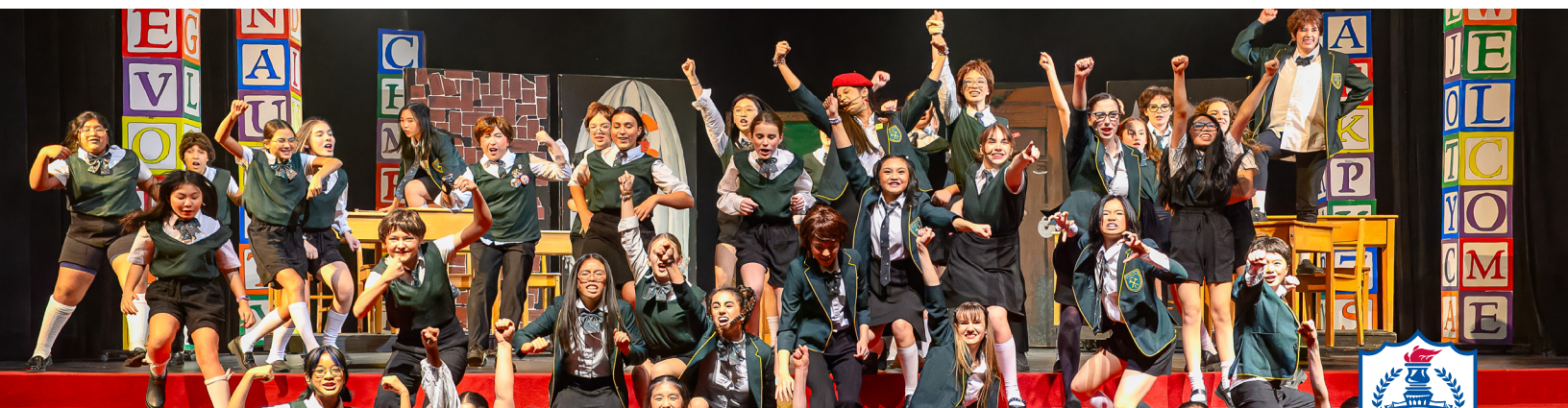
Roald Dahl's Matilda the Musical , fall 2024