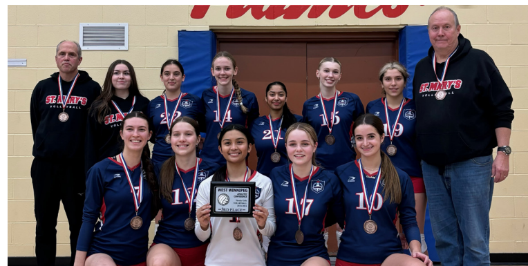
Top: Flames Varsity Cross Country Team Bottom: Flames Varsity Volleyball Team