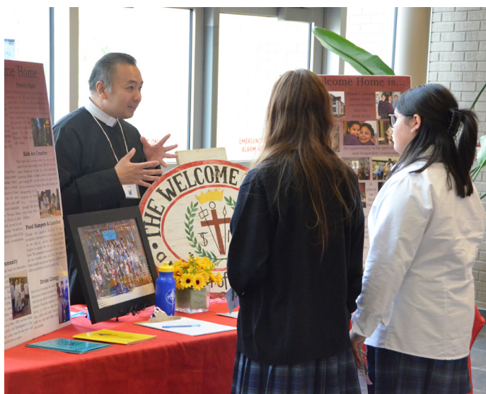
>Service Fair, fall 2023

CHARISM IS A DISTINCT SPIRIT THAT ANIMATES A RELIGIOUS CONGREGATION. IT'S A CALL TO MANIFEST THE GOSPEL IN A UNIQUE WAY. ST. MARY'S CHARISM FLOWS FROM THE GIFTS GOD GAVE TO BLESSED MARIE-ROSE DUROCHER, THE FOUNDRRESS OF THE SISTERS OF THE HOLY NAMES OF JESUS AND MARY. THE CHARISM IS ROOTED IN THE PRIMACY OF GOD'S LOVE AND THE POWER OF EDUCATION TO DEVELOP THE POTENTIAL GOD GAVE EACH OF US.