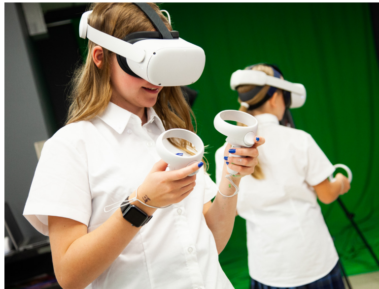
Students experience virtual reality with the Meta Quest 2 headsets in the Tartan Technology and Innovation Centre