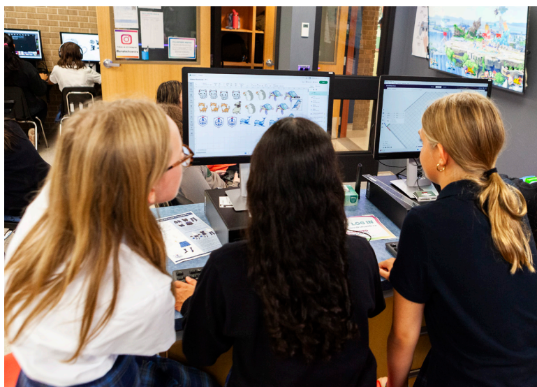
Students create stickers using the Cricut machine in the Tartan Technology and Innovation Centre