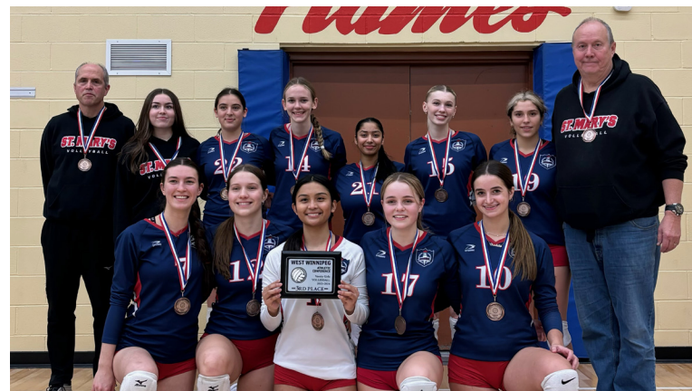
Top: Flames Varsity Cross Country Team Bottom: Flames Varsity Volleyball Team