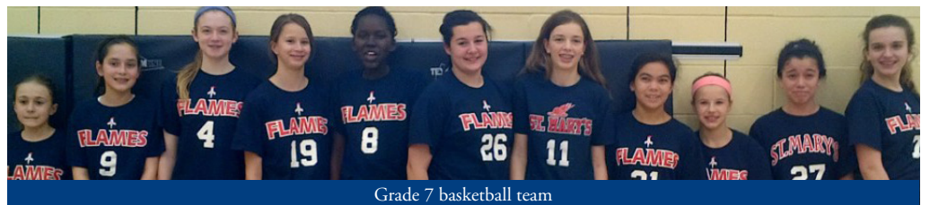
Grade 7 basketball team