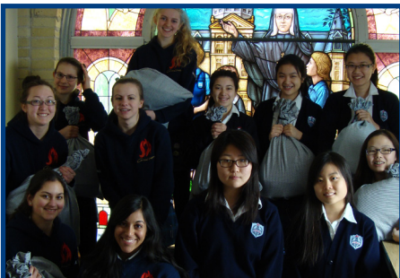
YIP members with full laundry bag hampers for Villa Rosa

Youth in Philanthropy (YIP) at SMA, in cooperation with the Winnipeg Foundation, is having a busy and successful year helping worthy causes in the Winnipeg community.