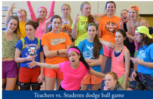
Teachers vs. Students dodge ball game