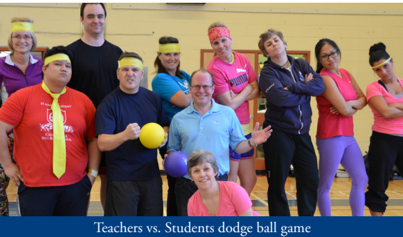
Teachers vs. Students dodge ball game