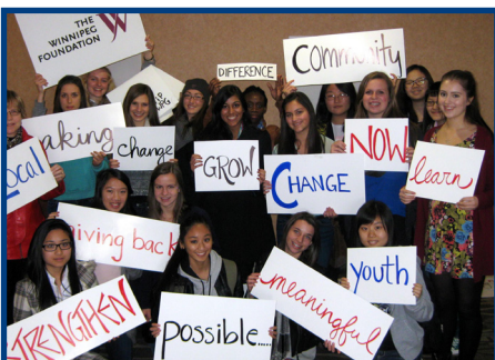
YIP members at October 2012 conference with Mrs. Challes