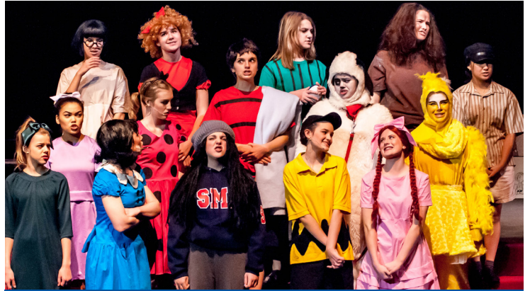
You're A Good Man, Charlie Brown