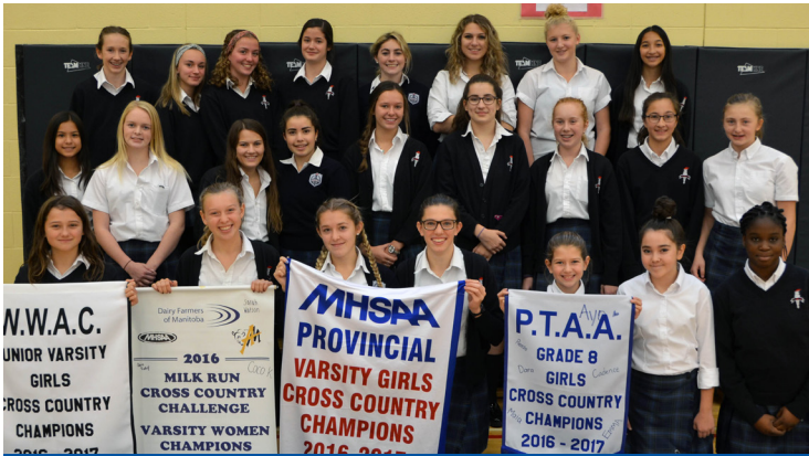
Cross Country Champions