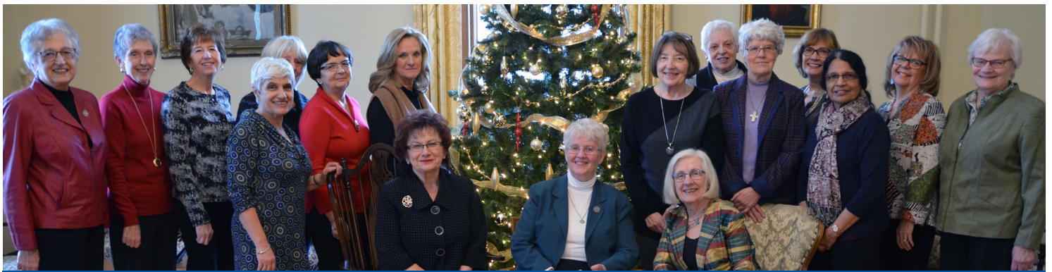
Retired and Former Staff Brunch