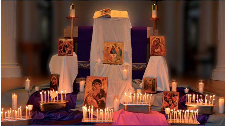
Holy Names Chapel during Advent Services