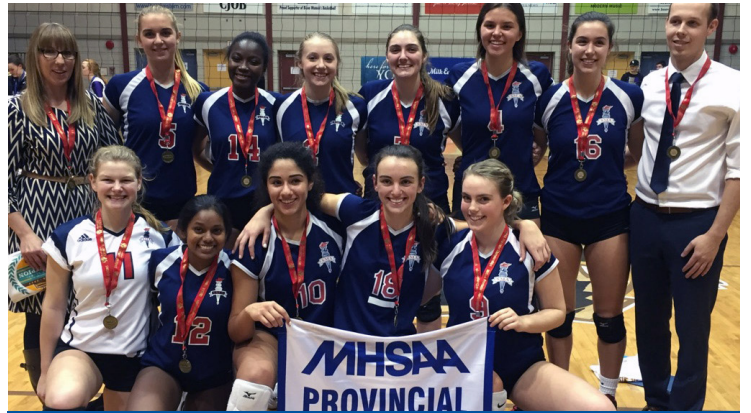
Varsity Volleyball Champions