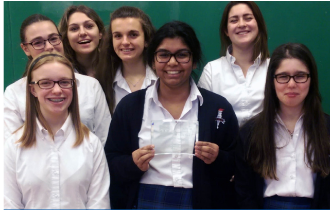
Rupert's Land Public Speaking and Debate Championship Participants