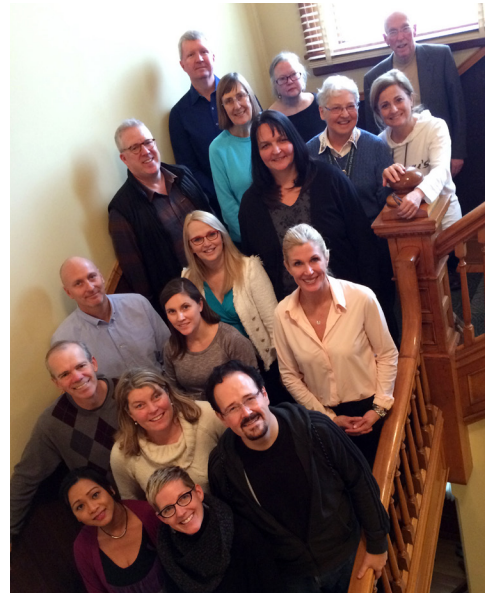
SMA Inc. Board of Directors