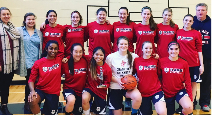
Flames Varsity Basketball Team - SMA Invitational Tournament Champs