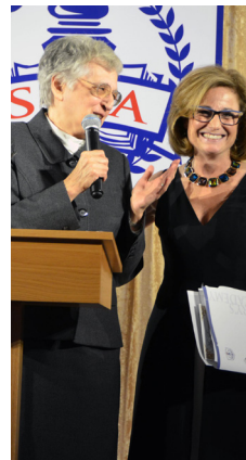
An Evening at the Academy