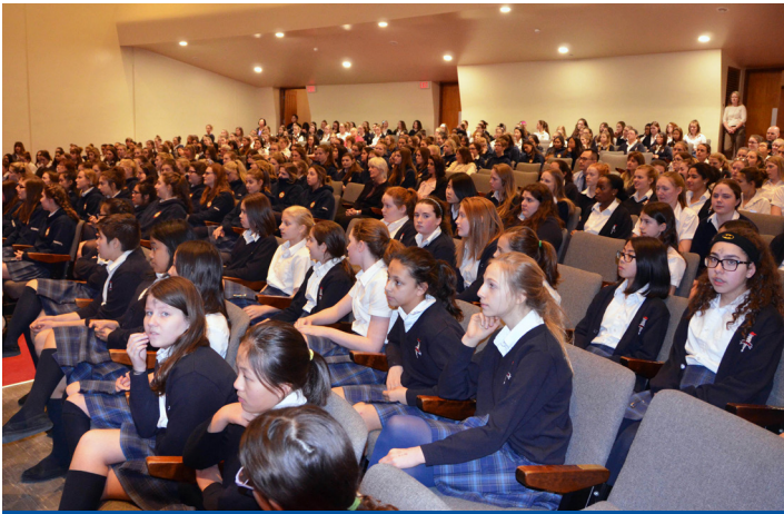
Ash Wednesday Service in Alumnae Hall