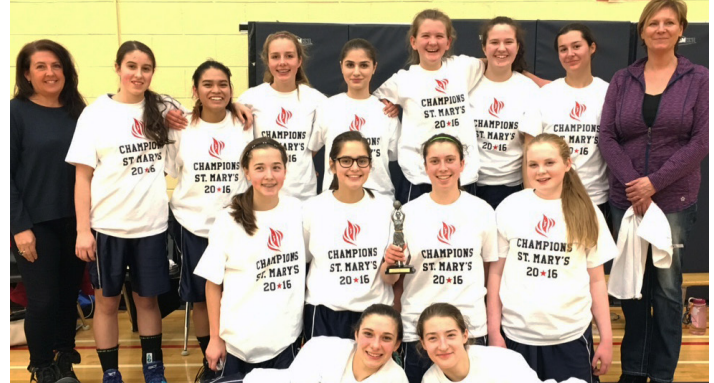
Flames Junior Varsity Basketball Team - SMA Invitational Tournament Champs