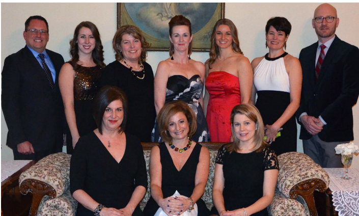
An Evening at the Academy Steering Committee