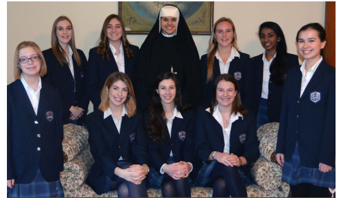
An Evening at the Academy Student Volunteers