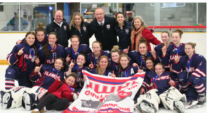
Flames Prep Team - Washington Challenge Cup Champs