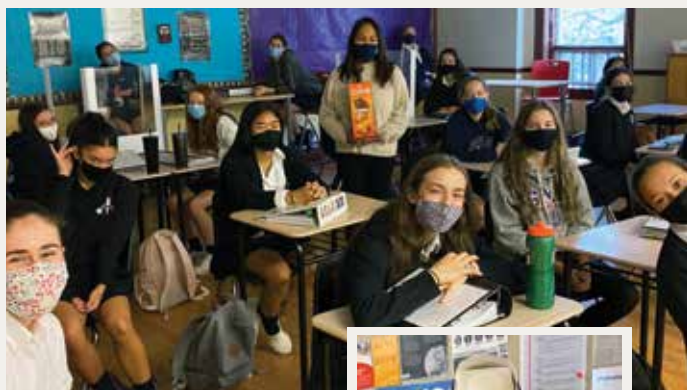
Virtual Prayer Service