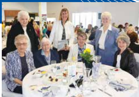
SNJM at the Marian Awards Brunch in 2019