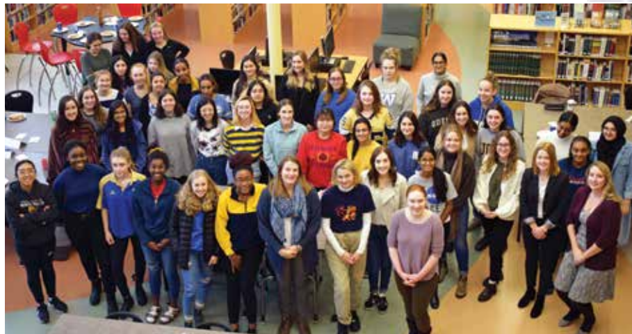
Ask an Alum, November 2019. Young alumnae with grades 11 and 12 students.