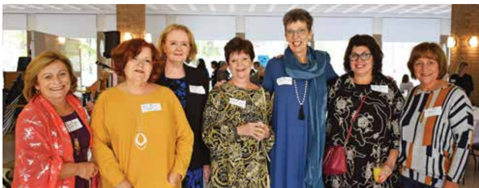
Classmates from the class of 1969 at the Commemorative Years Brunch

The Class of 1969 held a Dinner Under the Dome to celebrate their 50th reunion in September of 2019.