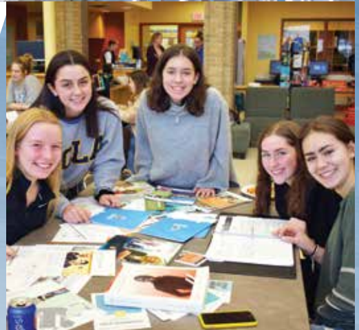
Students at Ask an Alum, 2019